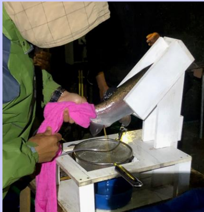
<Rainbow trout aerial egg collection>