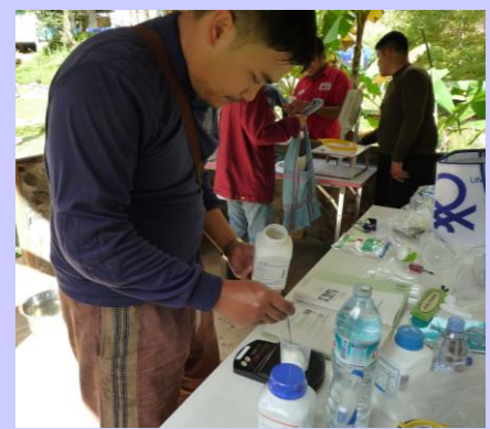
<Adjustment of isotonic solution>