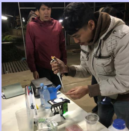
<Confirmation of rainbow trout sperm motility>