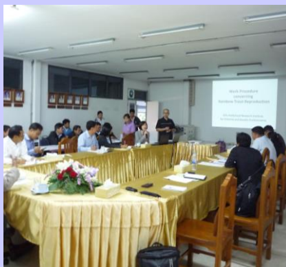
<Lecture on rainbow trout egg collection>