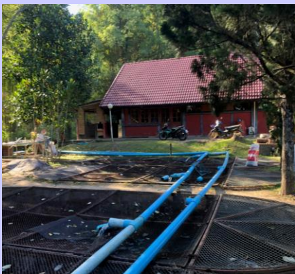
<Breeding ponds at Doi Dam Fisheries Research Institute>

Hatching larva production: 10,000 to 100,000