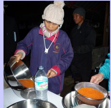
<Egg washing with isotonic solution>